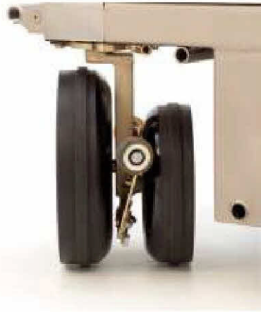
SWT - Soft Wheels