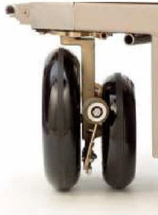
SCWT - Soft Compound